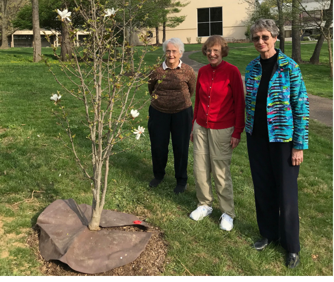
THE EARTH DAY PLANNING COMMITTEE AT CATHEDRAL VILLAGE PLANTED A MERRILL MAGNOLIA.