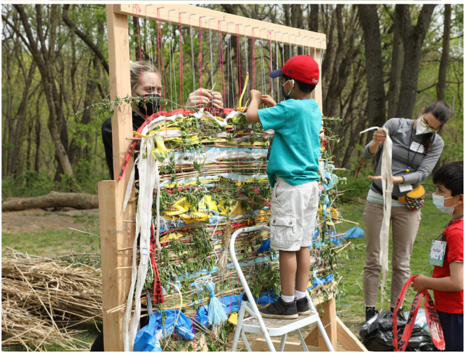
NATUREPALOOZA, OUR FAMILY-FRIENDLY EARTH DAY FESTIVAL.