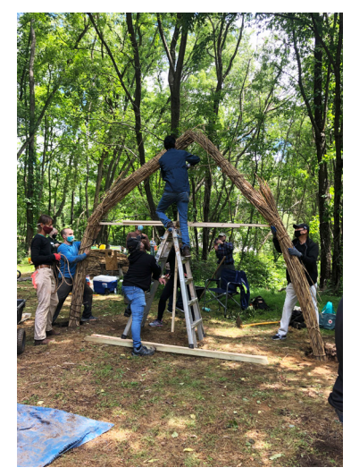
ABOVE: IRAQI IMMIGRANTS, U.S. VETERANS AND ARTISTS CAME TOGETHER TO START BUILDING THE MUDHIF

On June 24 at 7pm, we will celebrate the opening of the mudhif on site. We welcome all to register for this exciting event. Look for summer programming around exchanges of war experiences, healing, and intercultural community building.