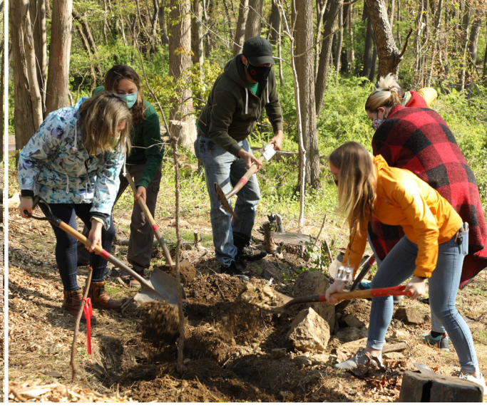
WE ASSEMBLED FOR A STAFF TREE PLANTING OF AN OAK TREE GROWN IN ROXBOROUGH FROM AN ACORN COLLECTED BY ONE OF OUR VOLUNTEERS.