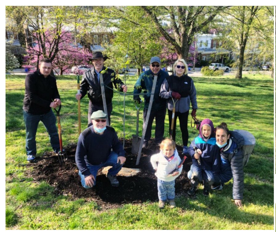
WE INVITED OTHER LOCAL CIVIC AND NEIGHBORHOOD ASSOCIATIONS TO JOIN US IN THIS EFFORT, AND THE FRIENDS OF GORGAS PARK CELEBRATED THE DAY BY PLANTING A RED OAK.